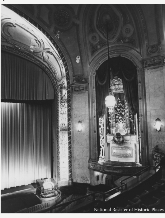
The Mighty Wurlitzer Organ in 1974 as taken by Curt Mangel.