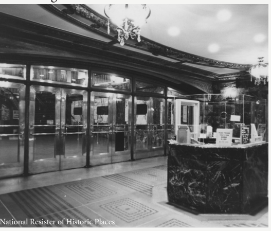
The Main Street Vestibule facing inward taken by Curt Mangel in 1974.