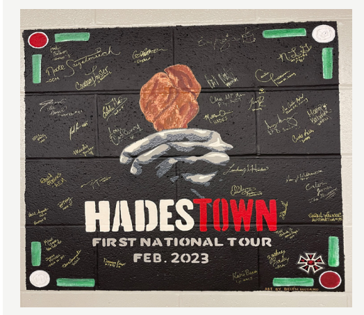
The First National Tour of Hadestown marked their stop at Shea's with a Buffalo-centric show tag, replacing their iconic rose logo with a chicken wing!

Did you know the basement of Shea's Buffalo Stagehouse is decorated in a unique way? Touring productions have a longstanding tradition of leaving their mark on theatres during their stops—by painting a mural on a portion of the theatre's walls! As part of the tradition, the cast and crew usually sign these "show tags," leading to some memorable signatures flanking the theatre walls. The wonderfully talented members of touring companies get to flex their other artistic talents in fun and creative ways. Some productions stick to their traditional logos, while others make fun twists to their art to commemorate the city they traveled to, an event or holiday that happened on the stop, etc. Shea's Buffalo is no exception to this tradition! Here are a few standout favorites that line our walls.