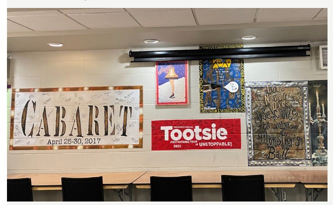
Our catering room in the stagehouse is the main home for all of our show tags. The room has been filled with many tour murals over the years.