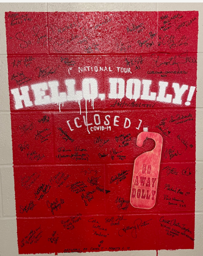
Hello, Dolly's time at Shea's was unfortunately cut short due to the Covid-19 Pandemic. To mark the unprecedented occasion, the tour made a spin on the show's title- Go Away Dolly.