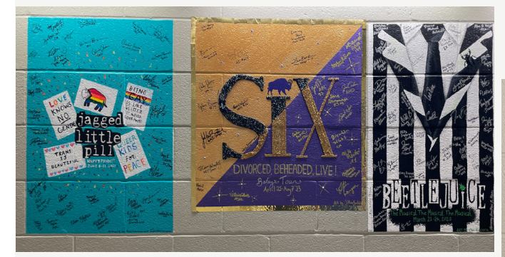
The last three shows of our season, Beetlejuice, Six, and Jagged Little Pill have side by side creations!