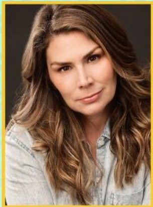
HEIDI BLICKENSTAFF (SHE/HER) MARY JANE HEALY